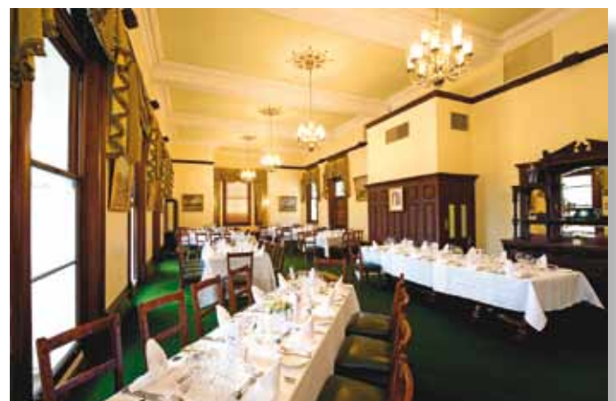
Convocation Venue: The Queensland Club, Brisbane