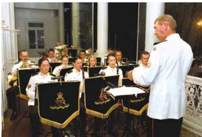
Band of the 1st Regiment of the Royal Australian Artillery