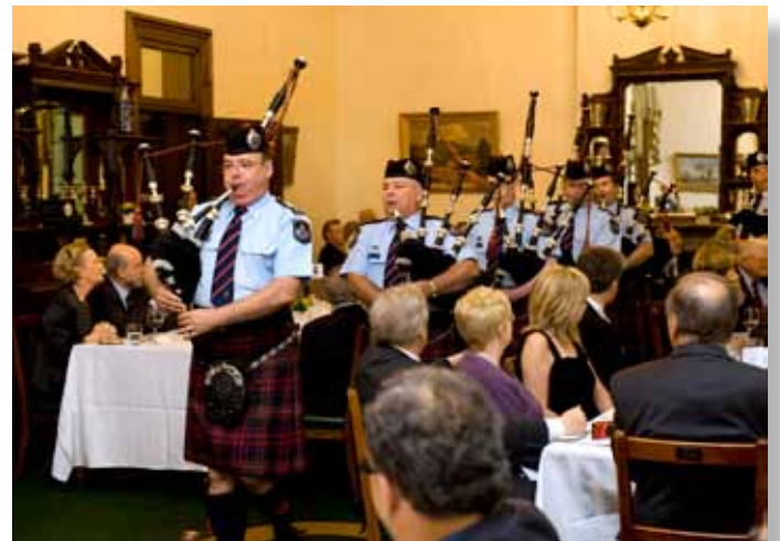
Queensland Police Pipes & Drums